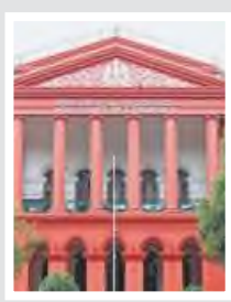
KARNATAKA HIGH COURT

The Chief Minister in power can misuse ACB to control his opponents within his party or the opposite parties. The conditions of the executive government order clearly depict that there is a possibility to favour the party in power or the partymen