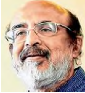
T.M. Thomas Isaac