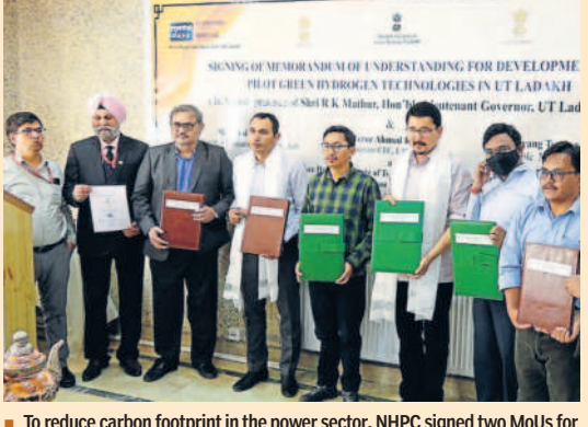
To reduce carbon footprint in the power sector, NHPC signed two MoUs for velopment of pilot green hydrogen technologies in Leh and Kargil district of Ladakh. As per MoU signed for Leh, hydrogen generated in Kargil will be used in fuel cells for mobility.