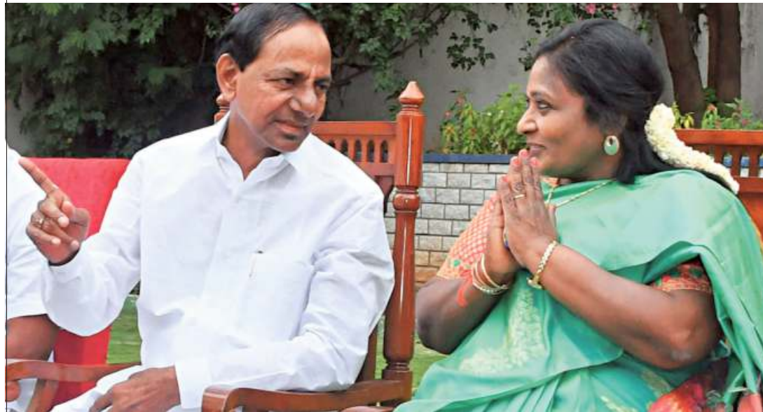
Chief Minister K. Chandrasekhara Reddy with Governor Tamilisai Soundararajan at an official function.

A major reason behind the differences appears to be the TRS' perception that the Governor has not shed her BJP background